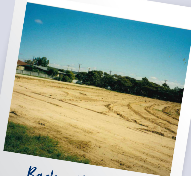
Back in the day

It is our commitment to the students and families at Tyndale that drives us to make positive changes to enhance their experience at the School. As we continue to evolve, our plans to help our lifelong learners reach their full potential also grows with the campus.